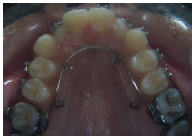
Fig. 3: Miniscrews placed palatally between the 2 nd premolar and the maxillary 1 st molar with customized TPA with soldered J-hooks

The treatment proposed was, distalization of the maxillary molars to correct the end-on molar relationship, to resolve crowding and maxillary teeth protrusion using palatally placed mini screws for anchorage.