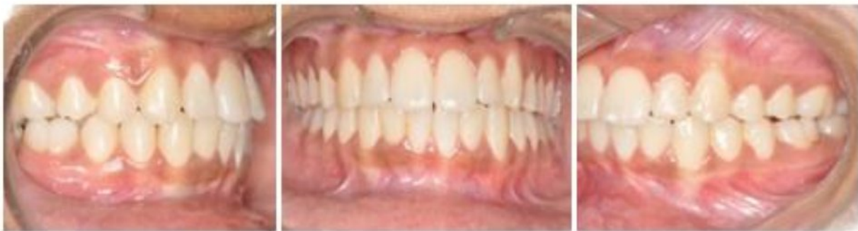
Fig. 7– Post treatment intraoral photographs-The maxillary peg shaped laterals were built-up and normal over-jet and over-bite established. The smile esthetics is many folds enhanced and the facial balance is maintained.

This included a strap-up with 0.022" slot MBT prescription of the segment anterior to the distalized molars. The arches were aligned, leveled and the space gained was utilized to decrowd the maxillary arch and for build-up of the peg laterals to normal morphology.