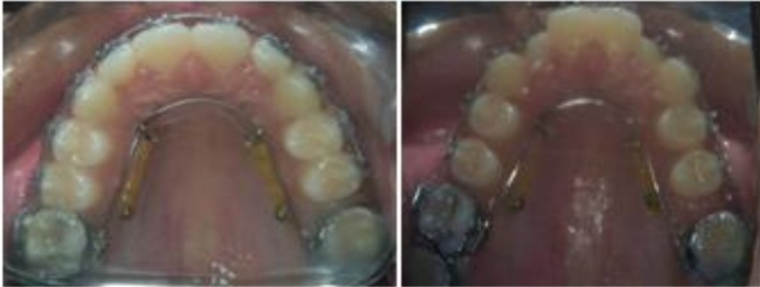
Fig. 3 Miniscrews placed palatally between the 2 nd premolar and the maxillary 1 st molar with customized TPA with soldered J-hook

of 0.036-inch (0.9 mm) hard round stainless steel with soldered J-hooks was constructed in a way to extent it bilaterally from one molar to the other. (Figure 3)