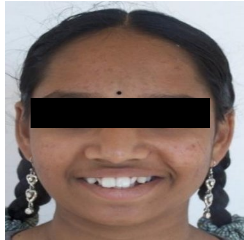
Fig. 1 – Pretreatment extra oral photographs: 13 year old patient with a slightly convex profile, mild retro-positioned chin, consonant smile arch with minimal lip incompetence

On extra-oral examination, the patient exhibited convex profile with slightly incompetent lips (Interlabial gap of 5mm), acute naso-labial angle, a consonant smile arc, adequate incisal display at rest (4 mm) and full maxillary incisal display during smile, with a mild degree of chin retrusion and prominent nose. (Figure 1)