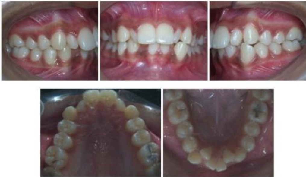
Fig. 2- Pretreatment intra-oral photographs demonstrating peg-shaped maxillary laterals with end-on molar and canine relationship bilaterally and lower anterior crowding

Conventional method of maxillary molar distalization (Eg: pendulum appliance, headgears) were not used due their adverse effects of